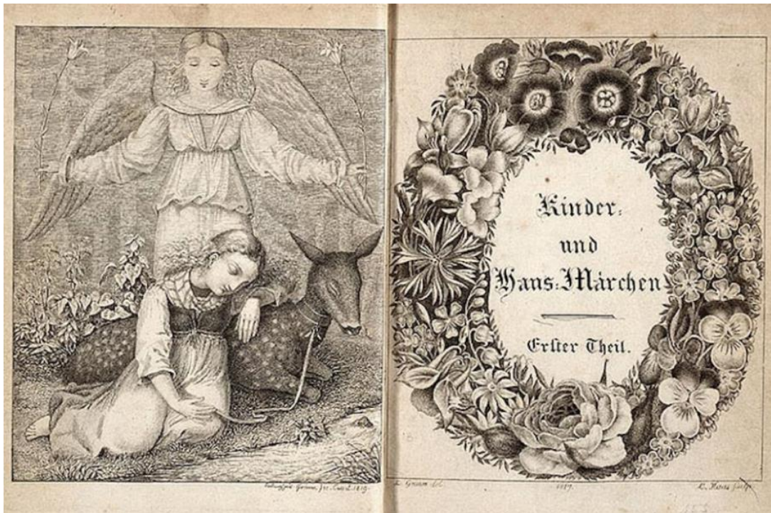
Fig 2: Illustrated by Ludwig Grimm, engraved by L.Haas, Frontispiece and decorative title page of an 1819 edition of the Brothers Grimm's 'Kinder-und Hausmarchen' (1819).

Originally, these folktales were not intended for children, hence why the Brothers Grimm revised them, incorporating Christian morals vales while removing explicitly sexual elements. For example, the first edition of Rapunzel is a 'tale in which the young girl gets pregnant'. The 1819 version is much more 'sentimental and without a hint of pregnancy'. 16 This example demonstrates the type of Christian moral messaging promoted in the 19 th century, particularly the belief that sexual relations should be confined to marriage, reinforcing purity culture, which is a fundamental part of Christian teachings.