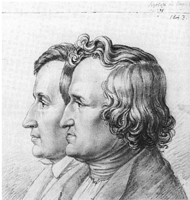
Fig 1: Ludwig Emil Grimm’s Pencil drawing of Jacob and Wilhelm Grimm (1843) . S. 15.3 x 14.9 cm 14

collecting oral tales, believing these stories represented the “pure” German spirit. ‘Oral tradition’ is the process of the ‘transmission of such messages by word of mouth over time until the disappearance of the message.’ 12 To preserve these stories, the Grimms worked together, collecting and writing them down. For example, ‘ Rumpelstiltskin ’ was collected from Lisette and Dortchen Wild (the latter, Wilhelm’s future wife), and a version of ‘ Snow White ’ was collected from the 17-year-old Jeanette Hassenpflug’. 13