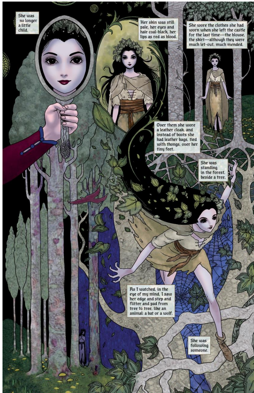
Fig 8: Colleen Doran's 'Snow, Glass, Apples' (1994), depicting Queen Regina locating Snow White after many years.