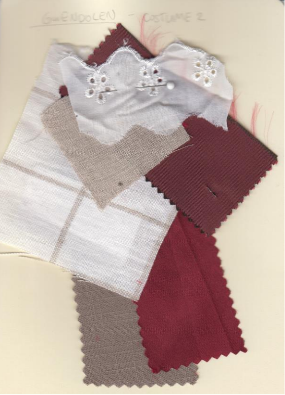
Gwendolen Fairfax Costume 2