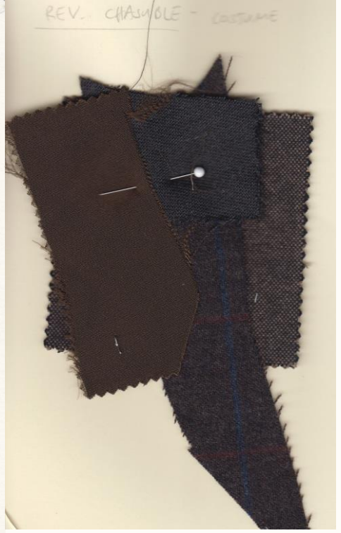
Reverend Chasuble One Costume