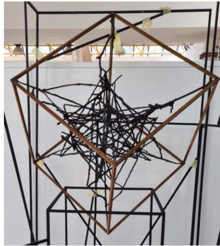
The Naked City. 2022. Steel, wood, mirror, sprigs of oak. 95x95x240 cm.