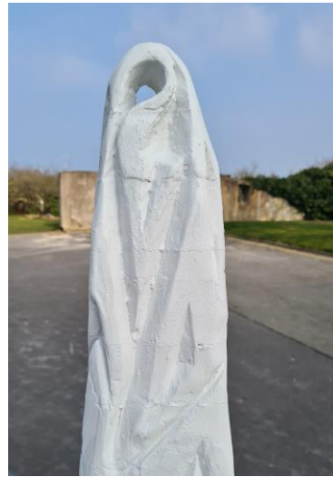
Obelisk of Memory 2022 Insulation foam, wood, metal, plaster, colours. 30x30x210 cm.