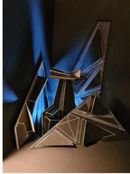
Black Plan Deconstructed. The above sculpture was cut into pieces and reassembled in a variable way with the addition of colored lights.