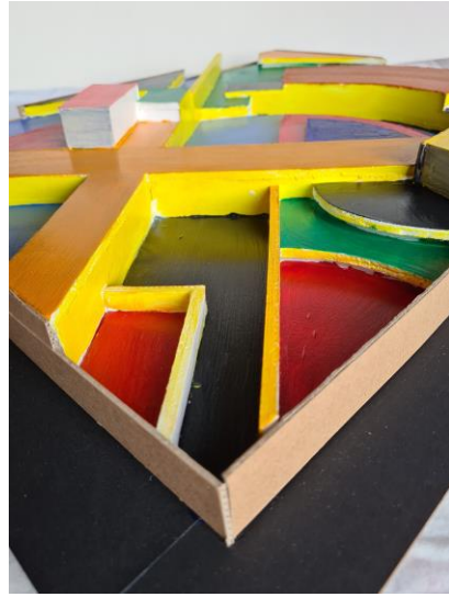
Energy 2D/3D. Details