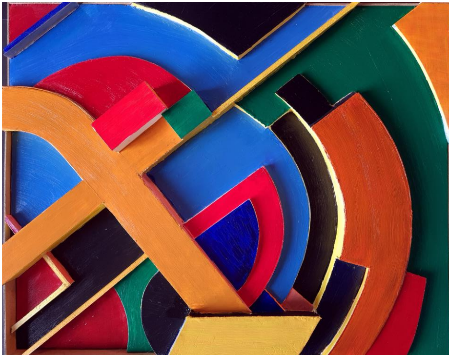
Energy 2D/3D. December 2021. Foamboard, cardboard, acrylic colours, wood. 56x60cm