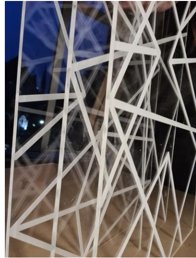
Laser Cut Palace. September 2021. Wood, 3 laser-engraved glass, light. 32x52 cm