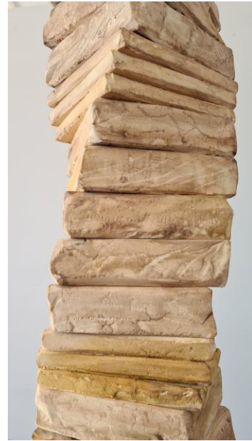
Ascent. 2022 Insulation foam, steel, wood, colours. 30 x 30 x 280 cm.