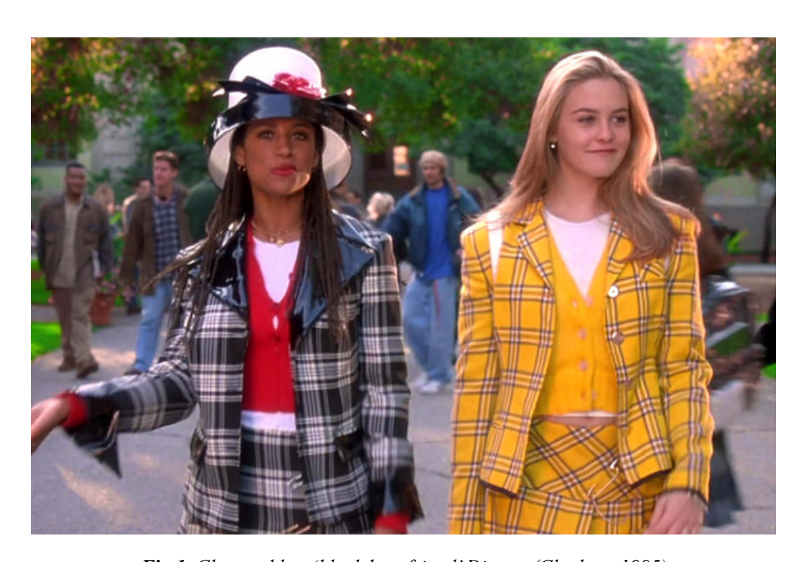
Fig 1. Cher and her 'black best friend' Dionne (Clueless, 1995)

In the following chapters I will explore the history of deaf representation in film from the twentieth to twenty first century examining both the positive and negative impacts it had on the Deaf community. As with any marginalised group there is a tendency to be represented on screen as a stereotype or trope, such as the "black best friend" archetype prevalent in cinema and television throughout the 90's and early 2000's. The "black best friend" often didn't have a storyline of their own and existed to "be