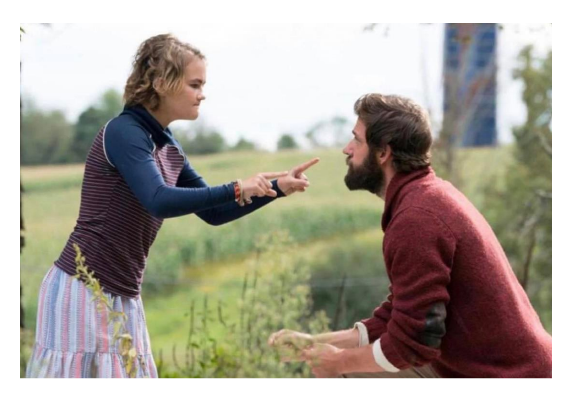
Fig 5. Regan talking to her father in ASL (A Quiet Place, 2018)

exception of Ruben who is played by Riz Ahmed of Pakistani origin. Female Deaf representation unfortunately still frequently conforms to the aforementioned "Hollywood deaf-themed movies featuring tragic deaf women being rescued by hearing people." John Krasinski's highly accoladed A Quiet Place (2018) and A Quiet Place Part II (2020) broke ground by being "the first of its kind within the modern horror genre for how little spoken dialogue it actually has." This is because the film's premise involves a family fighting to survive in a world overrun by blind monsters who hunt with their sense of hearing. The reason the family are able to