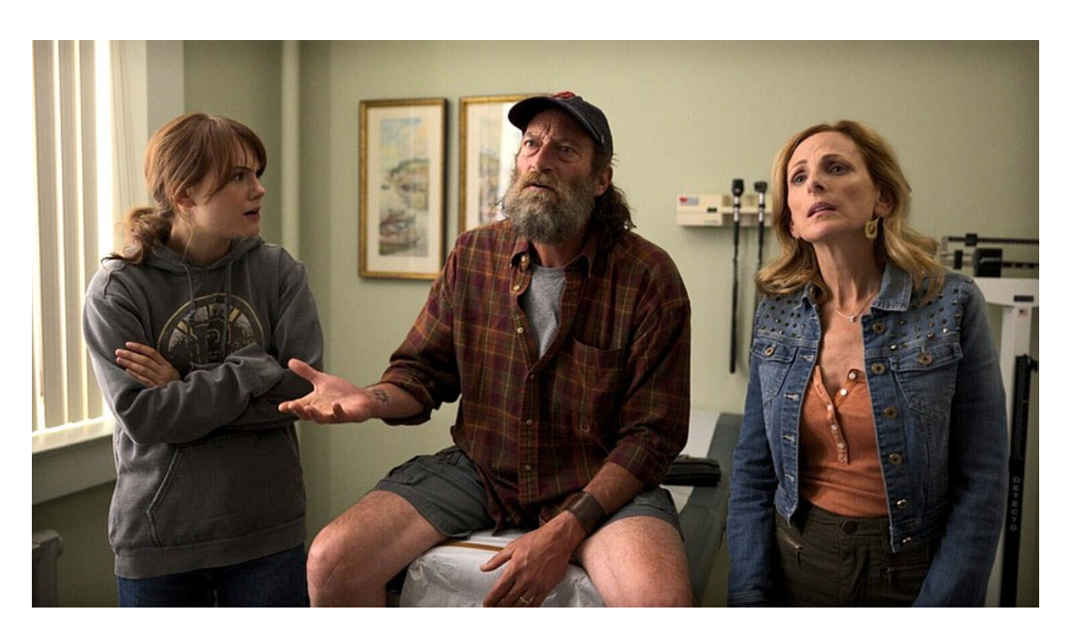
Fig 6. Deaf actors Matlin and Kotsur in a humorous scene about their characters' sex life (CODA, 2021)

rival and even exceed that of their hearing counterparts."65 Deaf writer Sara Novic also praised the film's portrayal of sexuality within the deaf community, saying "I liked that these characters were sexual beings - deaf and disabled people are often neutered or virginal in movies and books, and that's extremely boring and inaccurate."66