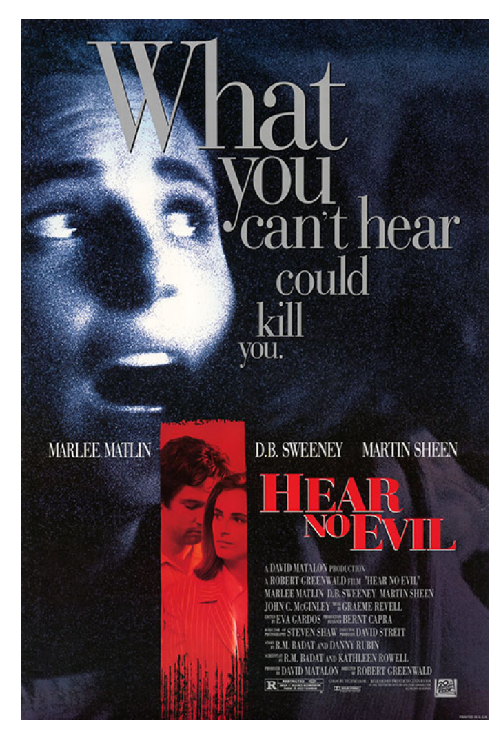
Fig. 3 "What you can't hear could kill you" - the 'deaf woman in peril' trope exemplified (Hear No Evil, 1993)

Pity was the most commonly used trope, with deaf characters either used to heighten the severity of the situation or to prove the heroism of the protagonist. This is exemplified particularly in horror films, where deaf characters are used to heighten the sense of fear as the character cannot hear the approaching danger, and to make the audience empathise more with the character as they are seen as 'weaker' or more vulnerable. "Thrillers with deaf characters typically put a deaf woman in peril"18 and this device is used