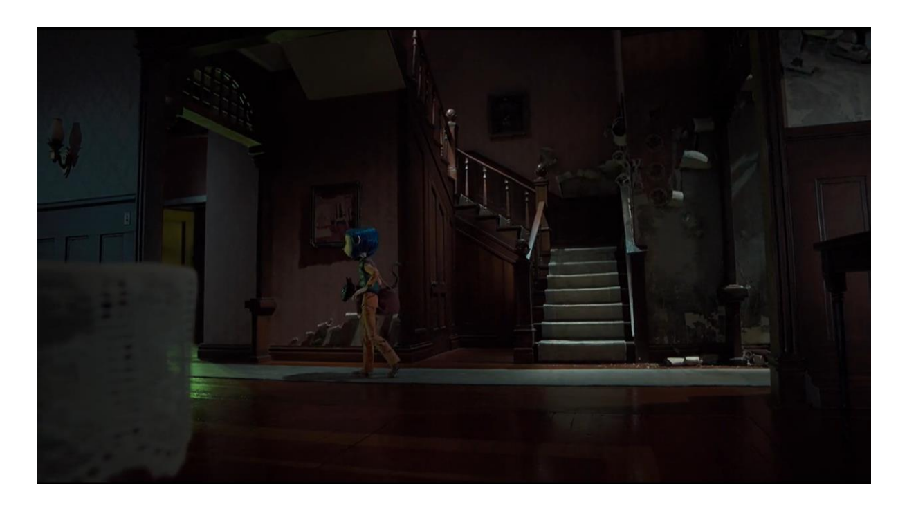
(Fi.g3.3 The Other World begins to deteriorate as Coraline finds all the eyes of the ghost children. Wallpaper peels from the walls.)

connection suggesting that they are, in fact, conjoined—a singular organism. As the Beldam dies, so does the Other World.