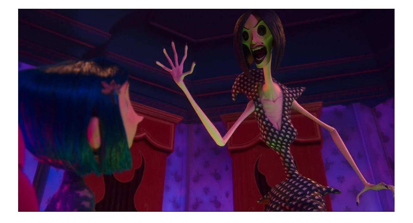
(Fig1.3 The Beldam begins to transform in a fit of rage. Her bones become more visible, limbs elongate.)

disobey the Beldam, and reject her food, her games and her advances to make Coraline stay with her forever that the Beldam gradually transforms into a homicidal monster - the 'terrible mother'. It is during Coraline's first attempt at standing up to the Beldam that the first stage of her transformation takes place, as she visibly grows taller and frailer, eyes hollowing out, limbs and fingernails elongated. It is not only the shift in appearance but the shift in demeanour that make it unmistakable that the Beldam falls under the category of the devouring or terrible mother. And with this transformation, a true motive is revealed, "you cannot leave me". In fact, the Beldam screams this motive as Coraline leaves the Other World for the final time; "Don't leave me! Don't leave me! I'll die without you!"<sup>23</sup>