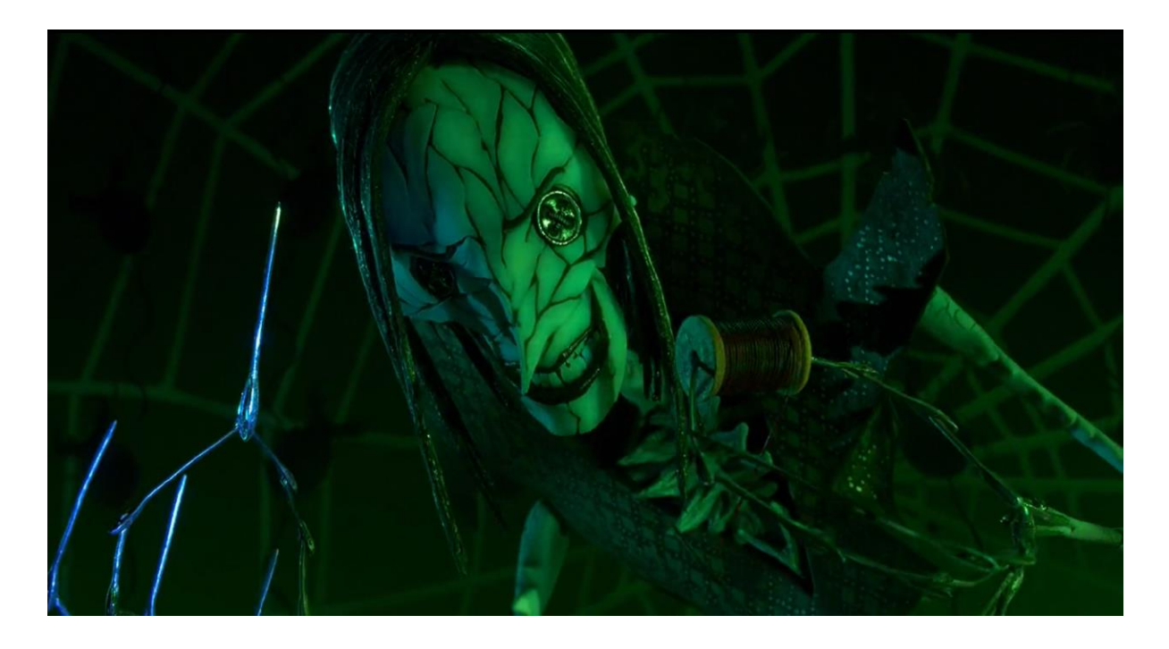
(Fi.g3.4 The Beldam withers and wastes away with the Pink Palace as Coraline resists being eaten)

interpreted as a lack of energy to maintain the facade, the mask of a replicated world- but better.