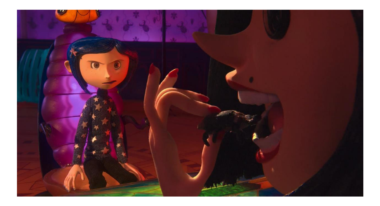
(Fi.g2.3 The Beldam bites into a beetle as Coraline watches on in disgust.)

Beldam creates a disturbing and unsettling feeling around her, one that is less human. This change in demeanour also further demonstrates my previous point that the Beldam is a devouring mother, as with Coraline's lack of compliance and growing sense of agency, she becomes a less benevolent and loving and more cruel and cold. Here she begins her transition into a monster, one that doesn't in fact consume the traditional homely foods she was using to lure and manipulate Coraline.