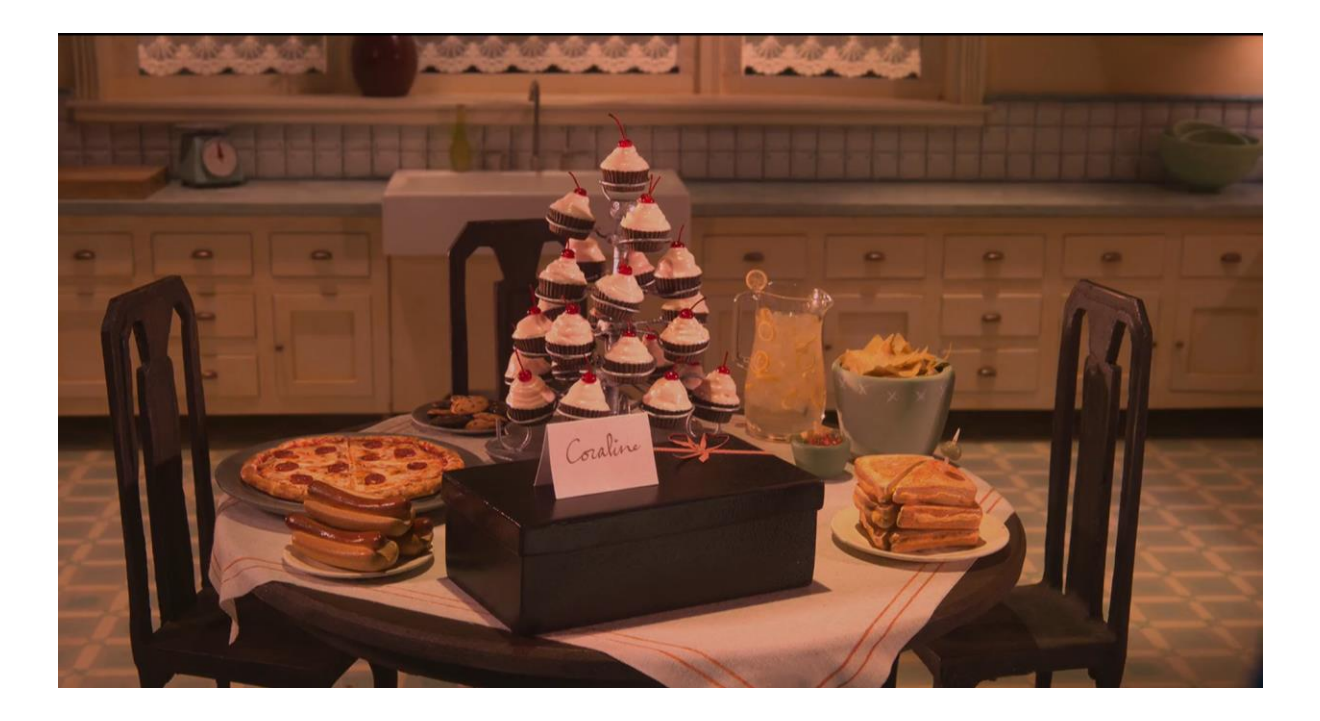
(Fi.g2.1 The Beldam has left Coraline an array of food to choose from)

Food is also hugely symbolic in representing Coraline's relationship with the characters in the story, specifically her mothers, real and 'other'. Her neighbours Spink and Forcible are associated with century old taffy, and Bobinsky, also known as 'the crazy man upstairs', frequently orders smelly cheese, of which he feeds to his mice. Coraline is repulsed by both of these foods, but gladly eats what the mirrored version of her neighbours offer her in the Other World, signifying her dissatisfaction with the real world. Her relationship with food in regards to her mother and the Beldam are even more salient, as I'll be discussing in this chapter, unravelling the intricate layers of symbolism embedded within these culinary connections.