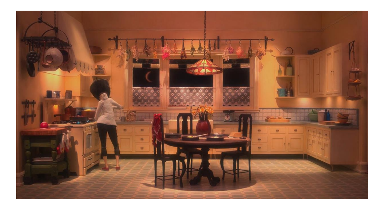
(Fi.g3.2 Coraline sees the Beldam for the first time in the kitchen of the Other World.)

began the moment she crawled through the little door. In offering Coraline the button eyes, the Beldam is attempting to reach the next stage of digestion, of which it is not possible for Coraline to escape.