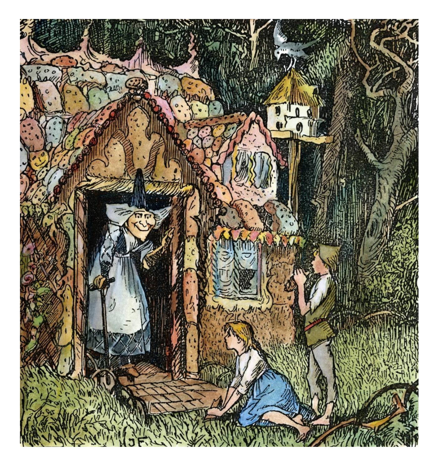
(Fig 1.3 'Hansel And Gretel', Siblings Arrive At The Witch's Cottage. Drawing, C1891, By Henry J. Ford For The Fairy Tale By Brothers Grimm)

Coraline 's warning and cautions as a modern day fairy tale do not stem from a literal threat of hunger, physical abuse or abandonment as its preceding tales did at the time of their