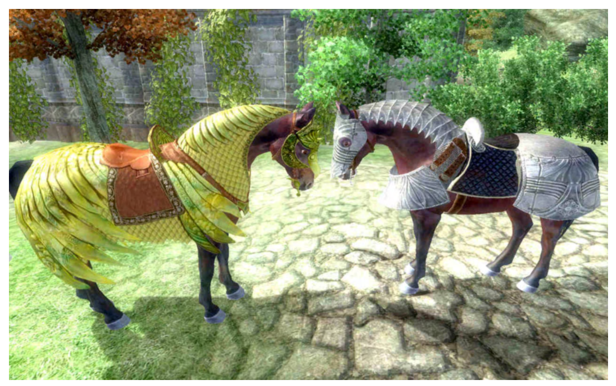
Fig 1. The Elder Scrolls IV: Oblivion, In-game screenshot, (2006)

In a fantasy land with races of all kinds, magic, mystical creatures and any fantasy weapon the mind wildly imagines what the first micro-transaction for a game of this could be and in turn, will be equally disappointed to see the reality of what it was. That reality was horse armour, this is the first-ever paid micro-transaction. It adds no benefit to the game, it doesn't add damage protection, and it is only an in-game cosmetic. Which is not unlike the micro-transactions of today. Visually it is striking with its over-the-top design and has an initial gold colour with unlockable variants in the game. The Horse Armour cost €2.50 when it was initially released in 2006 and would be packaged in with further versions of the game following the release. It was not greeted with acceptance but anger and controversy. There are multiple reasons for the controversial reception of the Horse armour. For one it offered no benefit in-game despite costing roughly 10% of an expansion, meaning for every 10 sets of horse armour sold, it equals the price of one of Oblivion's expansion packs which greatly expanded games and offered hours of playability. So was it purely due to a value for money or is there something else?