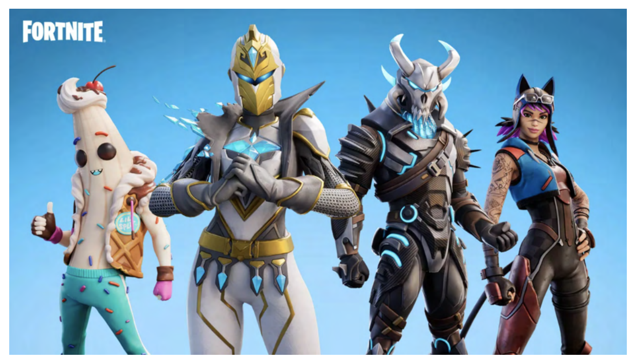
Fig 12 & 13, Fortnite, (2023)

Aside from the less dynamic background, the main difference is the fact that in image 1, all of the characters are holding a variety of weaponry while in the second photo, none of the characters are holding any weaponry of any kind. The second big difference is the use of blue as a background for the characters, as mentioned earlier, Fortnite commonly uses blue as a colour for its menus and in colour psychology, blue is primarily associated with trust and loyalty.