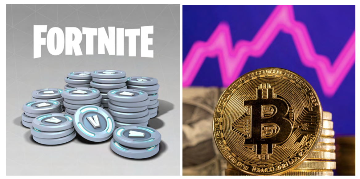
Fig 16 & 17

A perfect token where trust is no longer necessary said by an anonymous user, observed by Dr O'Dwyer is fundamentally impossible, trust is currency and where there is currency of any kind, there will also be trust. The focus of her book is that of the blockchain and the cryptocurrency that goes with it. While not explicitly in the same vein as Bitcoin and the blockchain, Micro-transactions and the items they purchase are not so different. In the coming future, it would not be unlikely to also see the inclusion of the blockchain in gaming, so how would this affect Micro-transactions and the current trust in gaming? Let us look at the similarities between Crypto-Currencies like Bitcoin and in-game currencies such as V-Bucks.