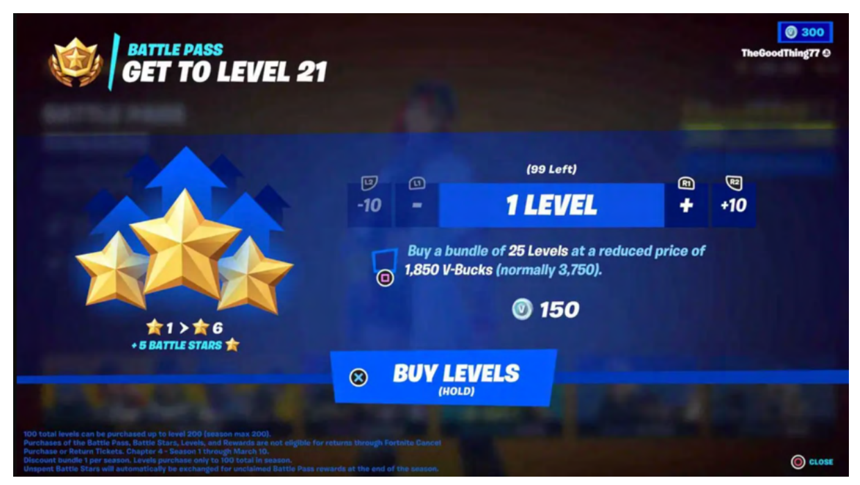
Fig 5. Fortnite, (2023)

other character and host of items. This leaves a player without having the necessary battle stars to purchase everything on the page, which further pushes a player to play. However people are busy, homework, jobs, family and life can all get in the way and it can be a time-consuming process to get all the items within a battle pass. There lies a paid alternative.