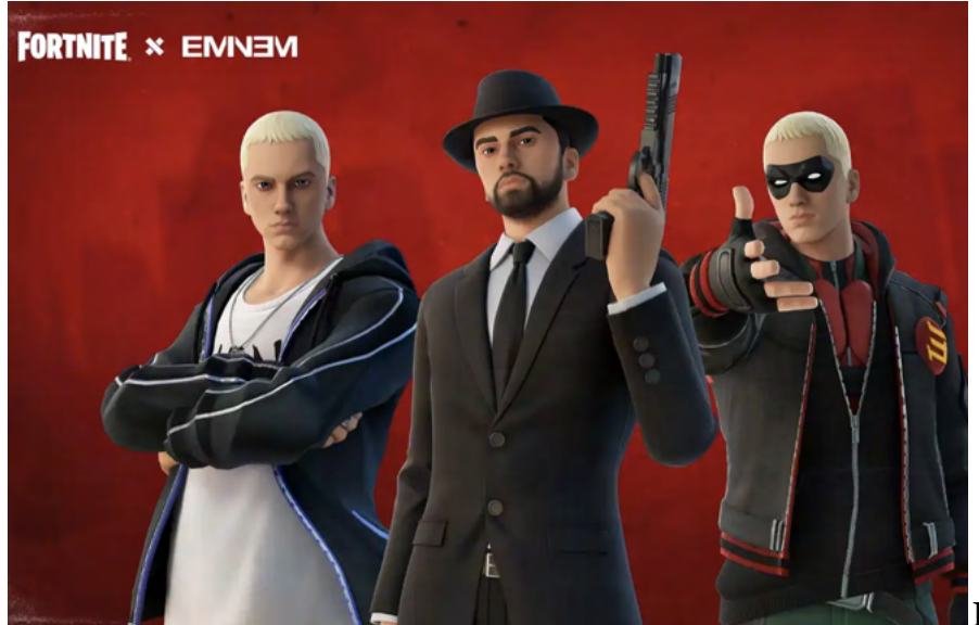
Fig7. Fortnite, (2023)

"Their value emerges, not from any strong correlation between share price and the underlying asset, but from the hype, circulating a bet. From vibes." <sup>15</sup> Another quote from Ms O'Dwyer perfectly describes the presence of these 3rd party skins and events. It does not matter what price Fortnite puts on these assets because their presence alone is a huge driving force for their value. Fortnite's use of 3rd party assets has increased as time has gone on due to the trust and loyalty the brand has. For one, it has an accommodating art style which allows even horror characters like Micheal from Halloween to look friendly without completely changing the fundamentals of the character.