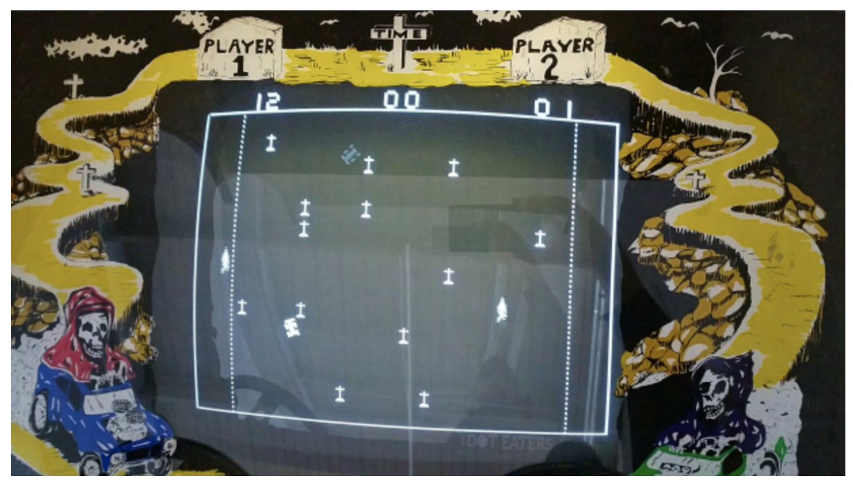
Fig 11, Death Race (1976)

Trust can be seen in every nook and cranny of Fortnite's code. From its development process to the trust companies and people have to collaborate with Fortnite and allow it to use their likeness and property, even down to the colour it uses for its menus. Trust is the most important gear within the Fortnite system. However true trust is earned and for Fortnite, the trust of parents is not easily achieved. Ever since the release of the Battle Royale mode in 2017, Fortnite's largest demographic is the young adult. "In the UK, the Video Standards Council rated Fortnite as PEGI 12 for frequent scenes of mild violence. In the US, the ESRB rate Fortnite as Teen, only suitable for those 13 years and older"<sup>19</sup>. So there it is, a game that is easy to control with approachable visuals, no blood and is safe for its demographic in the eyes of the law. With all this taken into consideration, Fortnite should be seen as a trustworthy game but even Fortnite is not without controversy. Video games with violence and the public reaction to these games are anything but a new topic. For example, the first arcade game was released in 1971 and in just 5 years, the first controversial video game would be born.