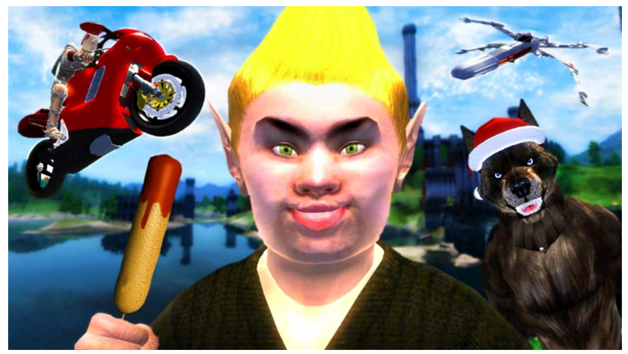
Fig 2 The Cantina,"Found Oblivion's Weirdest Mods" (2018)

"While sometimes simply playing can lead players to feel as if they are taking part in creating the game world, other times players do help construct the game's universe by modifying—or "modding"—the game."<sup>4</sup> These tools allowed for huge amounts of modifications which in these circles would be abbreviated to just "mods", mods would affect all aspects of the game, from the visuals to the gameplay to the characters and stories.<sup>5</sup> These tools would of course carry over to Oblivion, with a whole new game and a plethora of new tools at the disposal of players. This trust between Bethesda and the fans would give the mods created by the community a real sense of value, despite how outrageous or silly they may have been, this trust and the plethora of modifications would attract even more players towards the franchise.