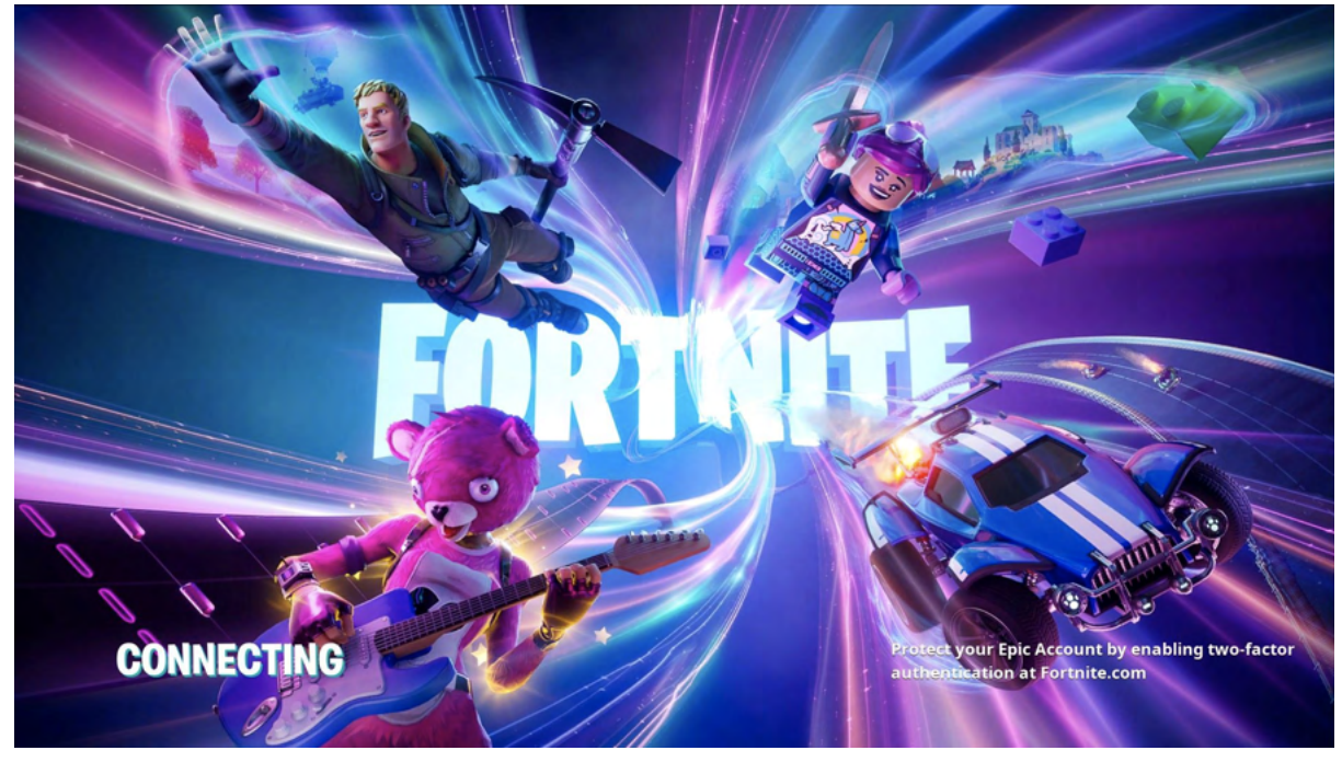
Fig 15, Fortnite, (2023)

Fortnite was trading trust for trust, its community was built on the backbone of its cosmetics and the showcasing of its battle royale. This trust would be very quickly recovered with Fortnite's following major update. The latest Fortnite chapter would not introduce one major game mode but instead three brand new completely separate modes.