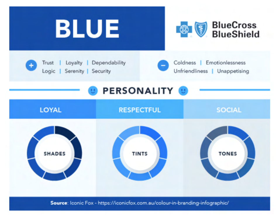
Fig 14 Color Psychology: How To Use it in Marketing and Branding, July (2023)

Fortnite was trading trust for trust, its community was built on the backbone of its cosmetics and the showcasing of its battle royale. This trust would be very quickly recovered with Fortnite's following major update. The latest Fortnite chapter would not introduce one major game mode but instead three brand new completely separate modes.