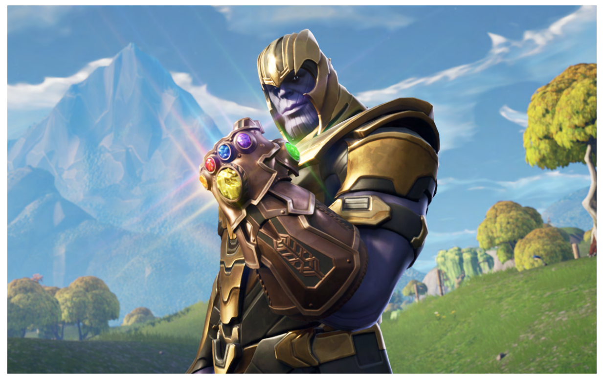
Fig 6. Fortnite, (2023)

A strong collaboration would pave the way for skins, abilities, emotes and more. As mentioned in the previous chapter, this loyalty and trust a person has in characters carries more value than money can buy. Offering beloved characters as playable skins and events allows Fortnite to enter communities it wouldn't have just by being itself. This loyalty a person has in a character or franchise will then have the ability to transfer over to the game itself, because playing a regular game of Fortnite may not sound as exciting as playing a game of Fortnite while dressed as a wide variety of characters from pop culture.<sup>14</sup> Also to note, Fortnite collabs are not limited to just fictional characters but they also include real-life people.