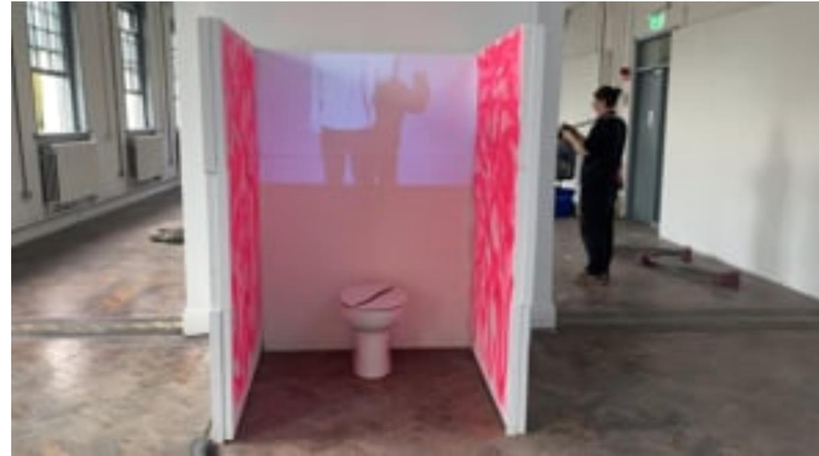
https://vimeo.com/944651478?share=copy this is a video of the installation in the space.

My video that is projected onto the back wall is composed of someone dancing alone, found footage of a 90's rave and myself DJ-ing. I wanted to focus on movement for the video aspect. The different styles of dancing while alone in an empty room compared to when in a crowd. I wanted to show the euphoria that I feel while im dancing. I played a dance playlist for the dancer in the video and I asked her to dance whatever way she wanted and to be as free as possible. Dancing makes me feel carefree and I wanted to pay homage to this in my video.