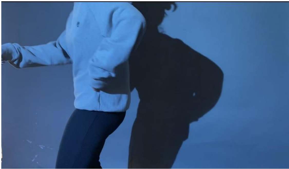
Still image from the video aspect of UTOPIA