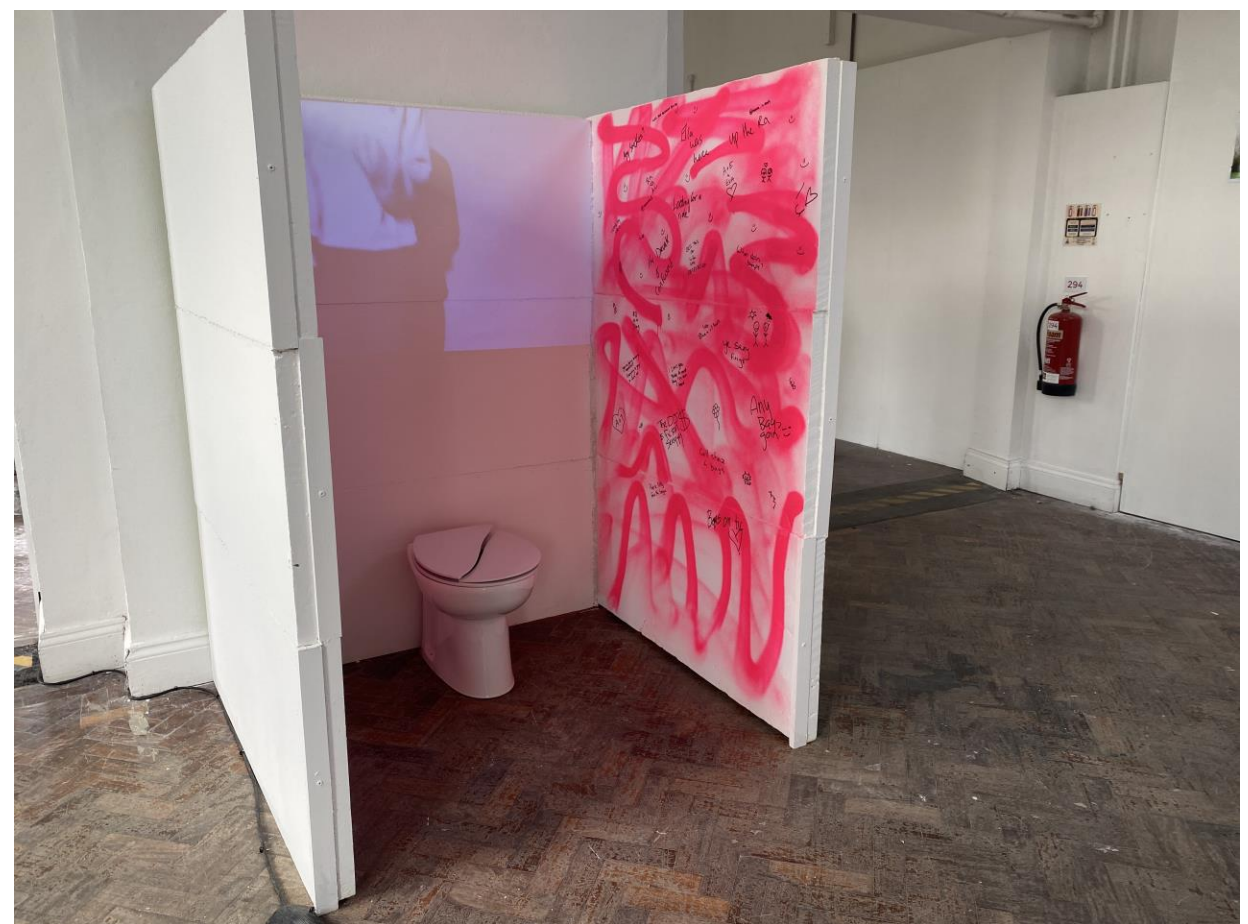
UTOPIA , 2024, installation and video, 4ft by 6ft

Here is UTOPIA fully installed with the broken toilet, bathroom stall and video projected onto the back wall.