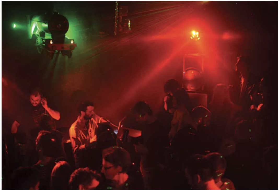
So Low , Katie Shambles, Photography, 2015.